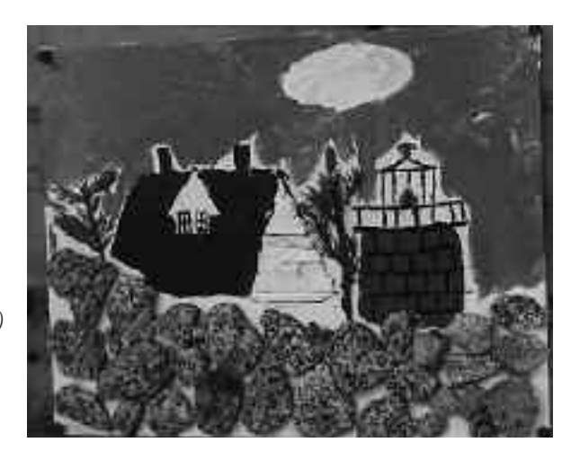
Nick Goodhue (age 13)

Shop counselor Jake Wheeless took the annual Shop Van Go trip to a new level this past summer by introducing some new materials. The boys did paintings of the local landscape in acrylic on canvas and used local materials to add depth and texture. The boys used rocks, branches and ferns on the paintings to great effect.