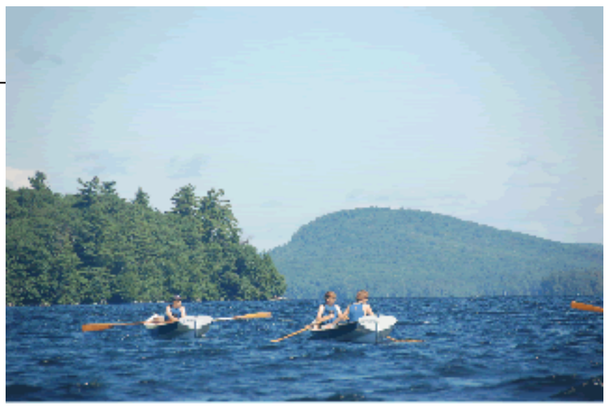
Rowing to Oak Island

Some say that King Kababa's throne is inside Mt. Philip and not on top of it.