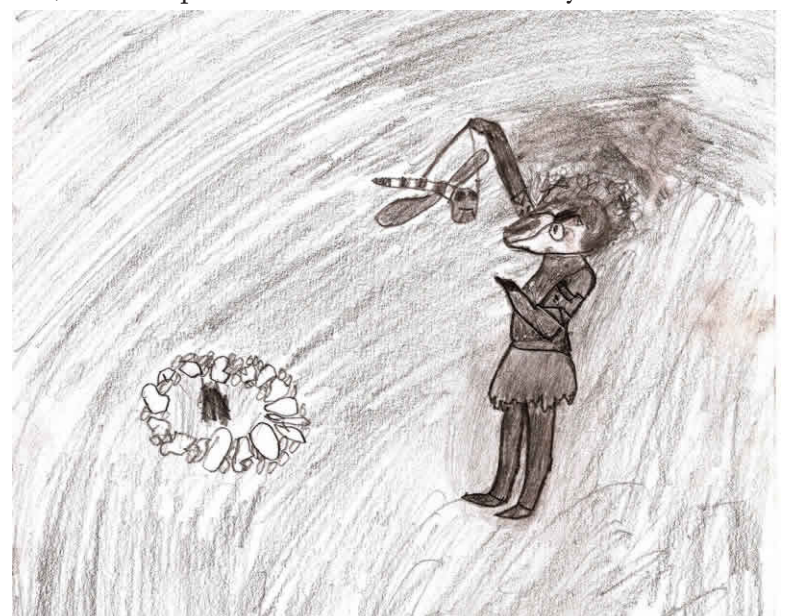
One of King Kababa's henchmen awards the sacred animal Darting Donald the Dashing, Devastating, Daredevil Dragonfly.