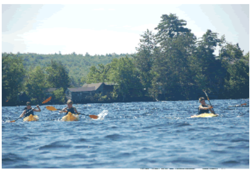
Kayaking on a Beautiful Day