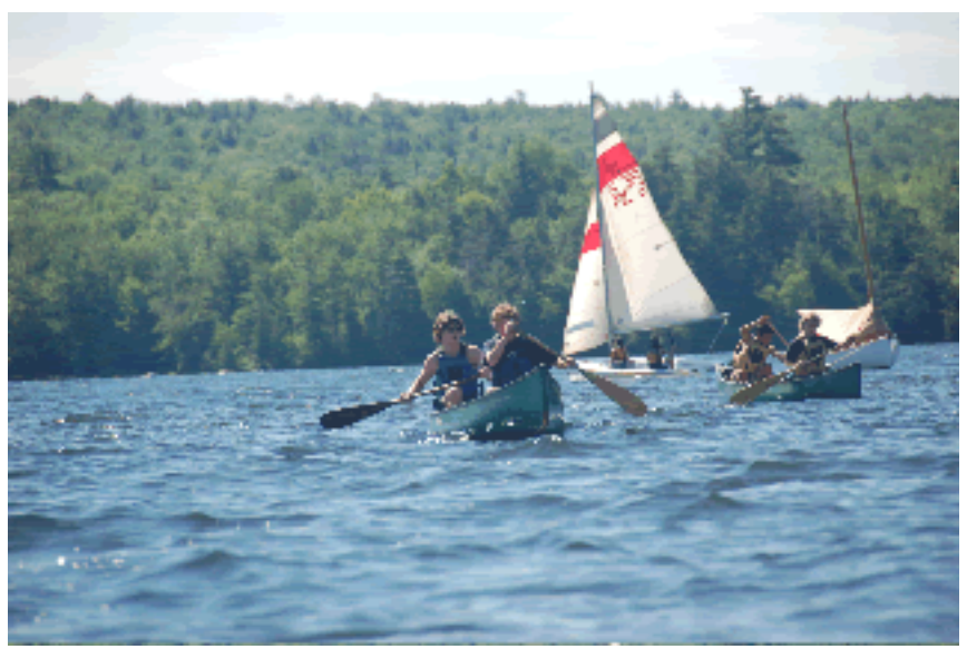
Canoeists and Sailors