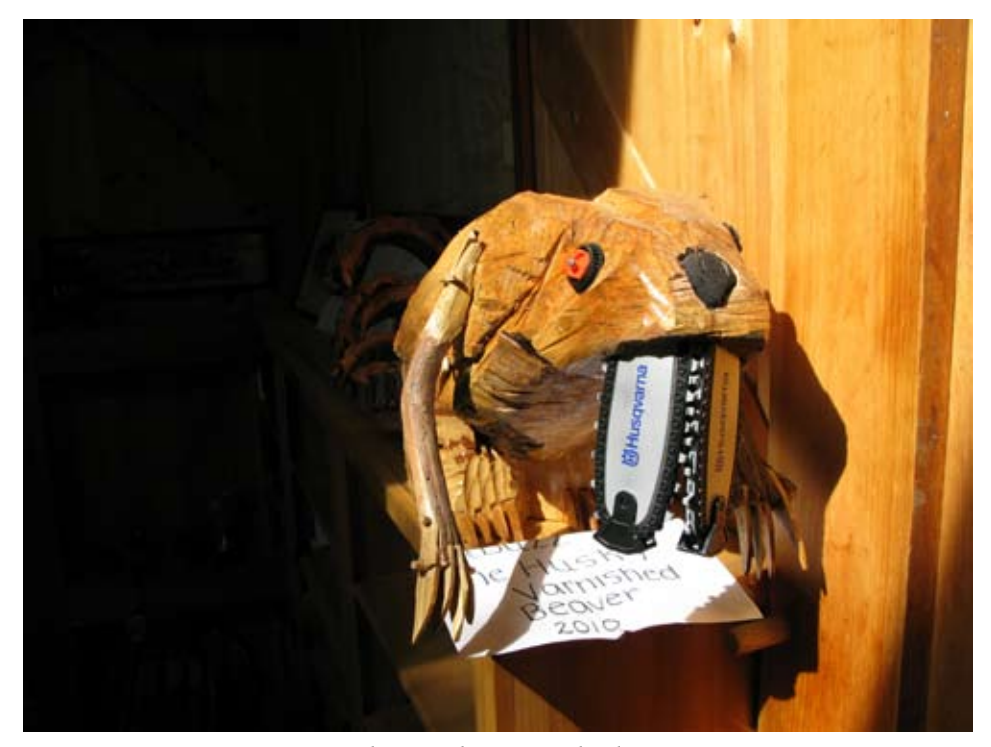
Buzz, the Husky Varnished Beaver

At the end of the summer, there is a Sacred Ceremony where we actually receive the animal. I have been to two Sacred Ceremonies. Each one was different. At both Sacred Ceremonies I have seen, we have received animals. In 2009